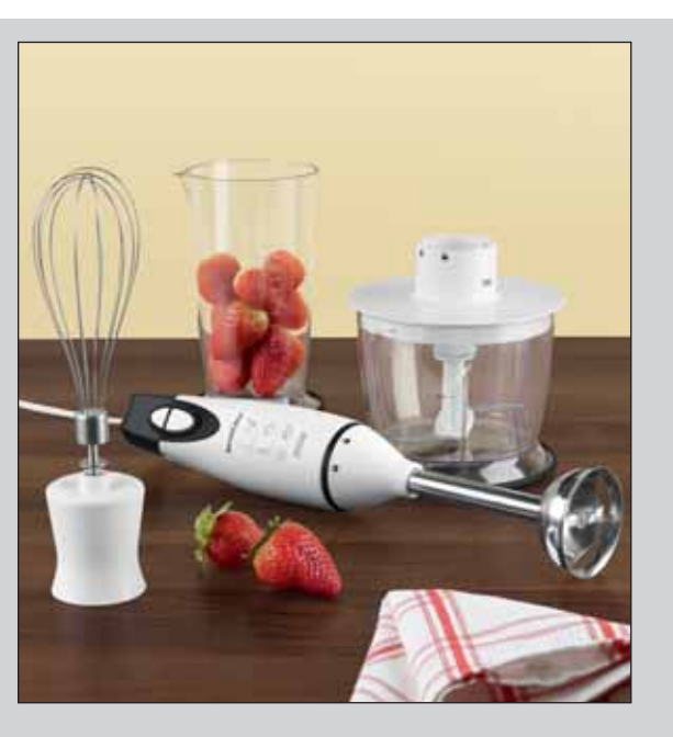
GB Hand Blender Set Operating instructions

KOMPERNASS GMBH BURGSTRASSE 21 · D-44867 BOCHUM www.kompernass.com ID-Nr.: SSMS 300 A1-02/10-V1